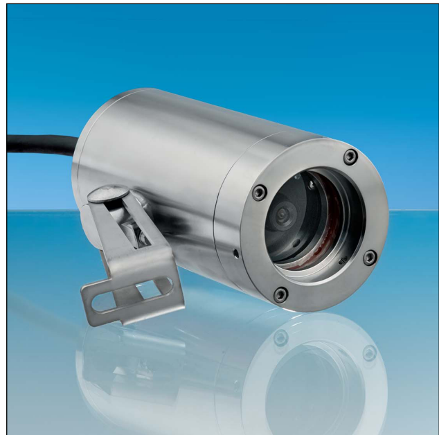
VISULEX camera K55-P with fixed lens

Any replacement of the camera assembly should be carried out by the manufacturer and/or done at the manufacturer's works (F.H. Papenmeier GmbH & Co. KG).