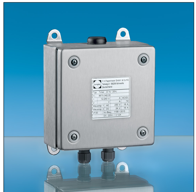
Lumistar Timer, stainless steel version