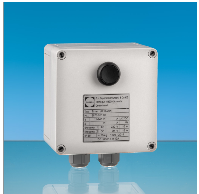
Lumistar Timer in synthetic housing