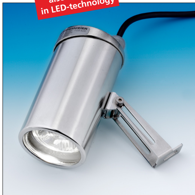
Lumistar luminaire USL 15 with hinged bracket mounting