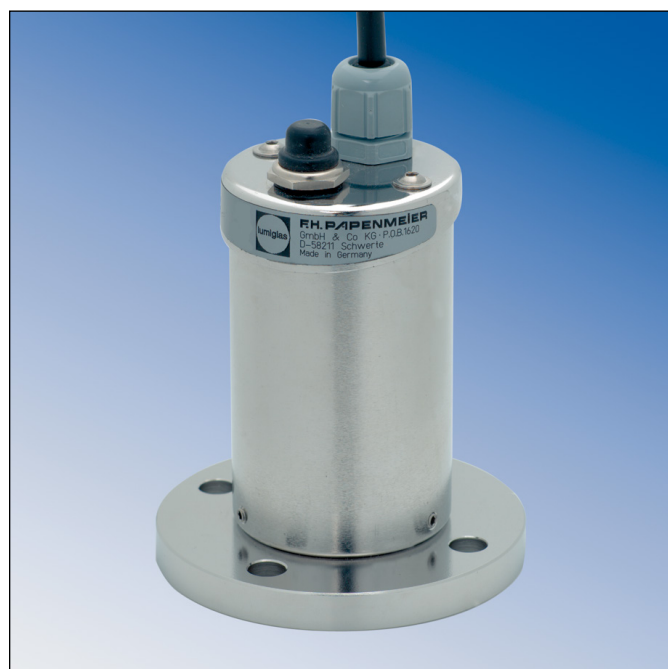
Lumistar luminaire USL 35 mounted on a BioControl sight glass with sterile technology

push-button or a timer to be installed in the power supply line, outside the luminaire! Under no circumstances should the maximum temperatures specified for the luminaire be exceeded.