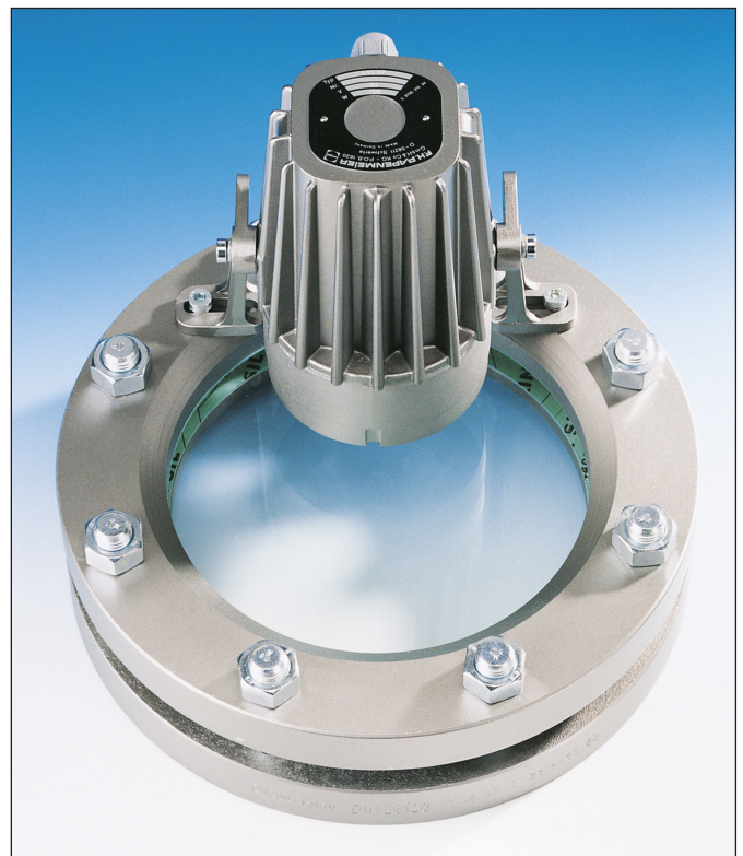
Application as a combined sight and light glass on a sight glass fitting acc. to DIN 28120, mounting by way of luminaire fastening