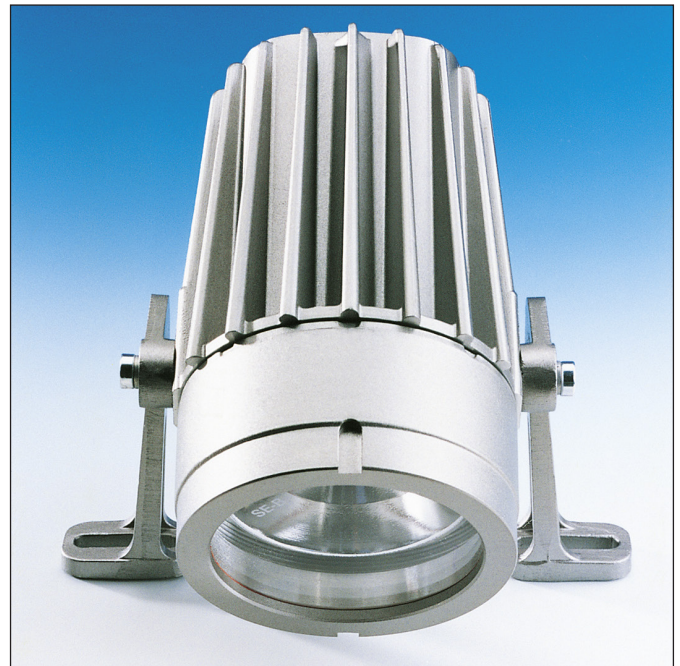
Lumistar luminaire USL 07 with mounting parts