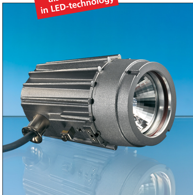
Lumistar luminaire USL 06