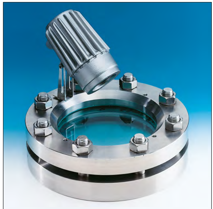
Application as combined sight and light glass on a sight glass fitting acc. to DIN 28120, mounted using a hinged bracket