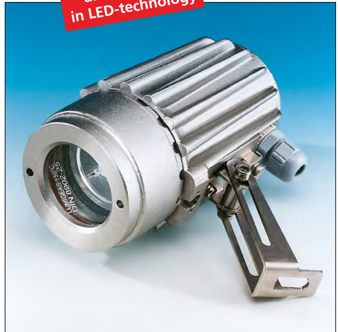
Lumistar luminaire USL 05