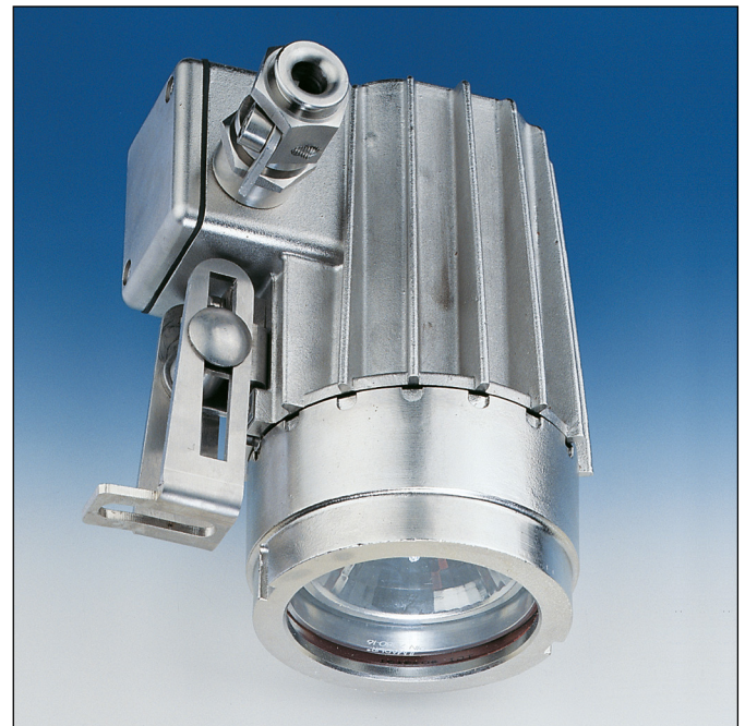
Lumistar luminaire ESL 26, stainless steel with integrated terminal box and hinged bracket fastening