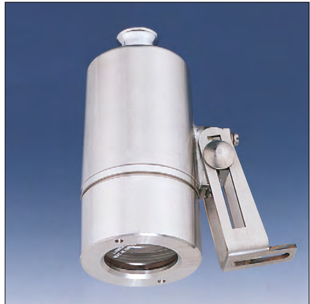
Lumistar luminaire ESL 25, stainless steel