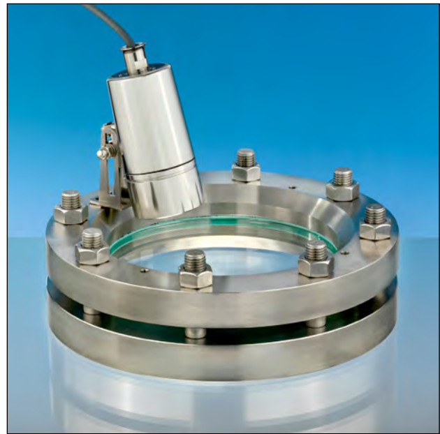
Application as combined sight and light port on a sight glass fitting acc. to DIN 28120, mounting by way of hinged bracket