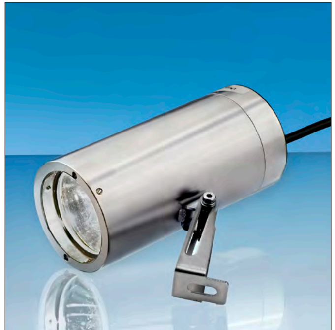
Lumiglas luminaire USL 16