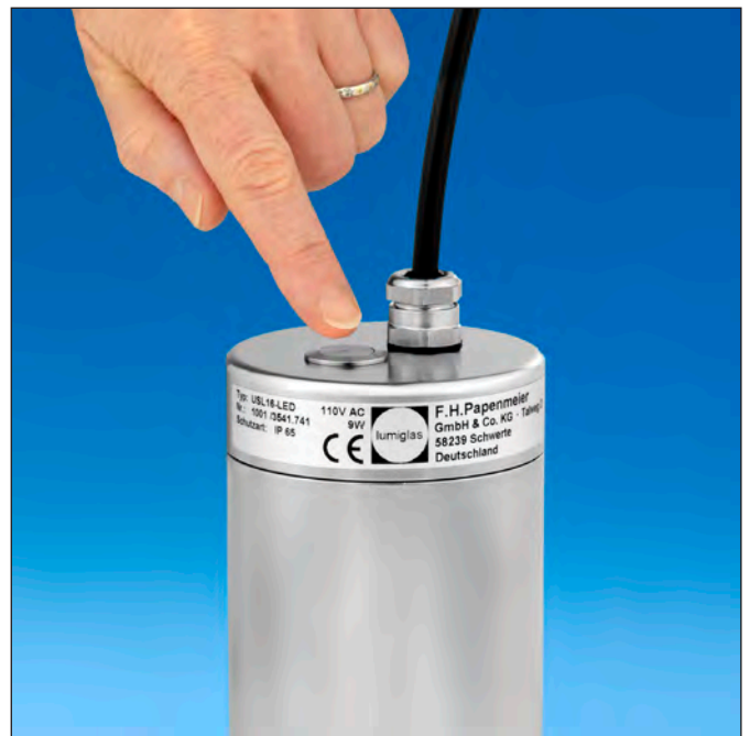
Lumiglas luminaire USL 16, actuation by momentary-contact switch

an integrated push-button, it is essential to have a momentary-contact switch or timer installed outside the luminaire in the power supply line!