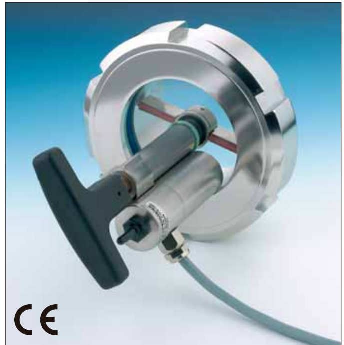
Lumiglas Mini-Luminaire Stainless Steel, Model USL01 with mounting clamp fitted on a screwed sightglass fitting with Lumiglas sightglass wiper type SW I

The clip on mounting clamp for the Lumiglas-wiper assembly (type SW I) is included in the supply as standard. If the option of hinged bracket is required, it should be ordered separately.