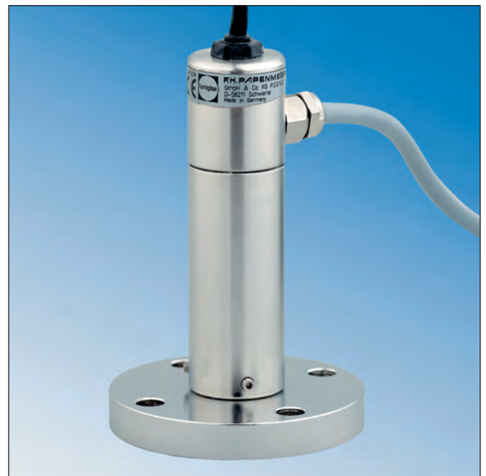
Mini-Lumiglas luminaire USL 31, for BioControl applications