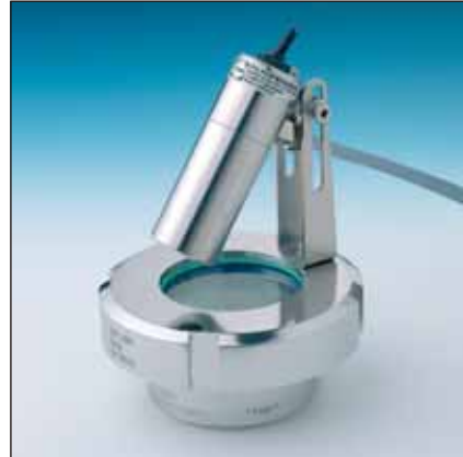
Lighting port assembly, showing Lumiglas Mini Luminaire Stainless Steel, Model USL01, with hinged bracket fitted to screwed sightglass (MV 50)