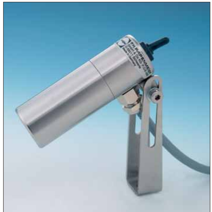
Lumiglas Mini-Luminaire Stainless Steel, Model USL01 with hinged bracket.