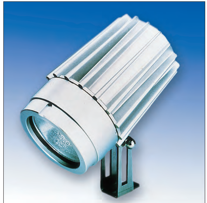
Lumiglas luminaire USL 06 with hinged bracket fastening