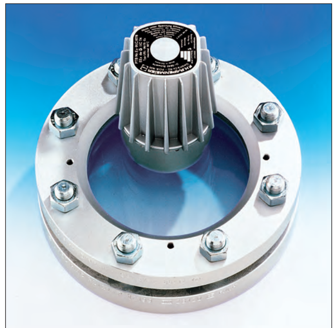
Application as combined light/sight port, fitted to a circular sight glass assembly to DIN 28120; fastened with hinged bracket (Ex-type)