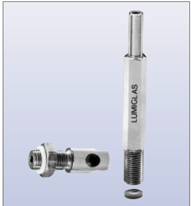
Lumiglas spray device