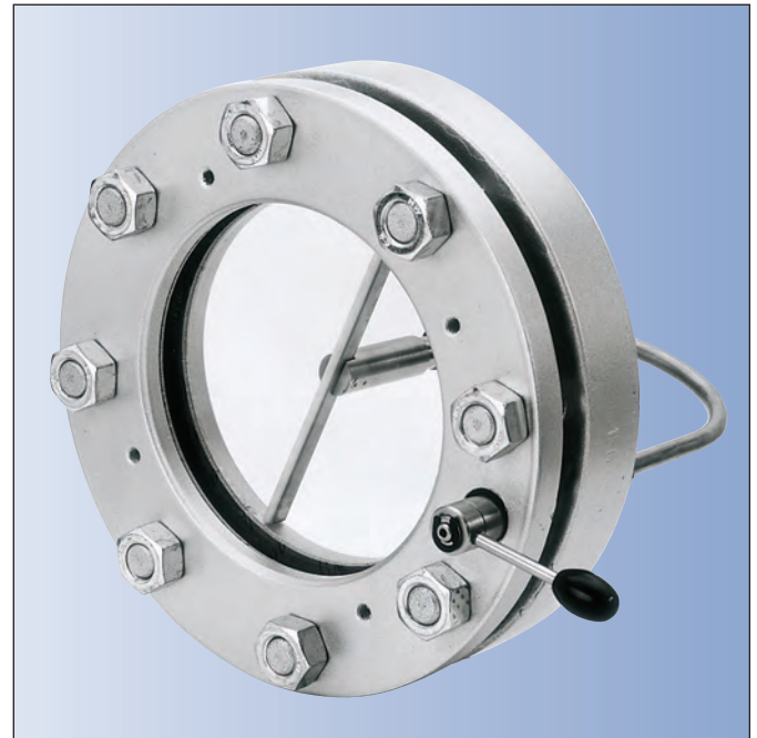
Lumiglas SW II BW mounted into sight glass fitting DIN 28120

Wiper blade: PTFE or silicone rubber All product contact parts are of stainless steel. Mechanical drive internal seal: PTFE