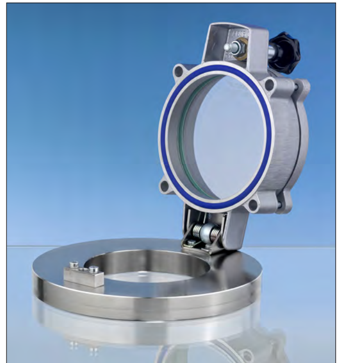
Lumiglas light/sight glass unit type SKS