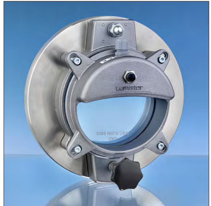
Lumiglas light/sight glass unit type ESKS

Check vessel for pressure and temperature before opening a sight glass fitting!