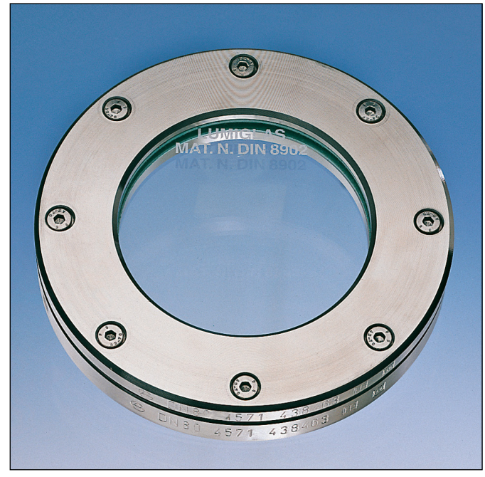
Lumiglas sight glass fitting in stainless steel