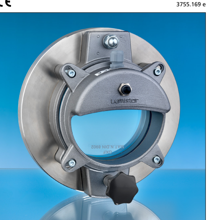
Lumiglas light sight glass fitting ESKS