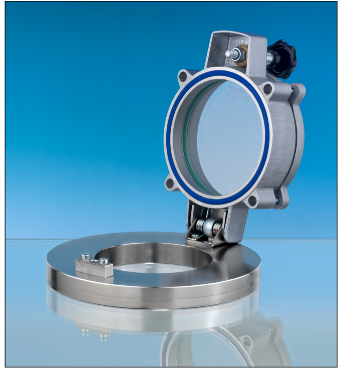
Lumiglas sight glass fitting SKS