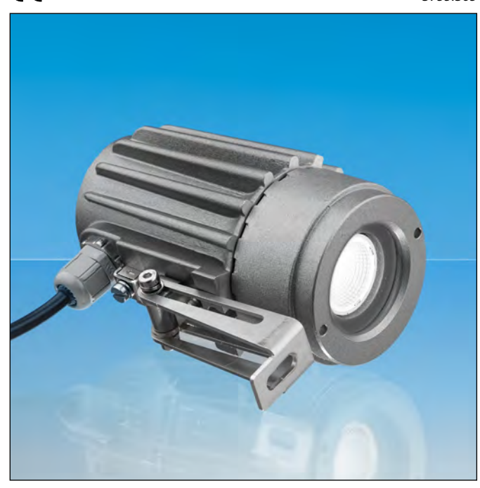
Lumistar luminaire USL 05 LED (24 V)