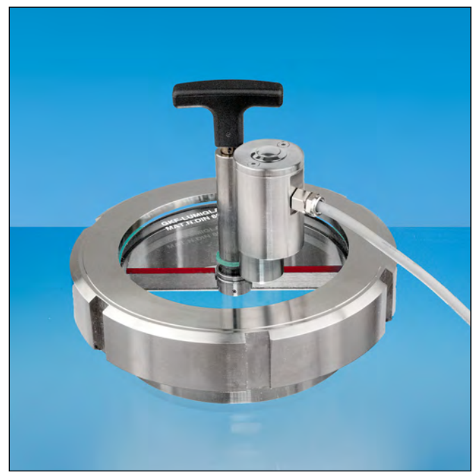
Lumistar luminaire ESL 51-LED-HK installed on a screwed sight glass fitting equipped with Lumiglas wiper unit SW I