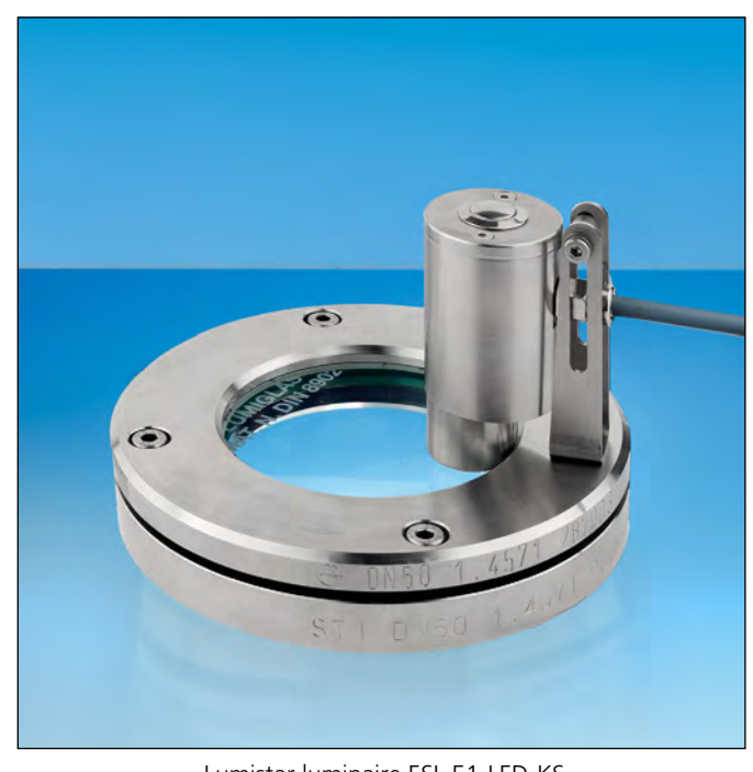
Lumistar luminaire ESL 51-LED-KS adapted to a standard flange