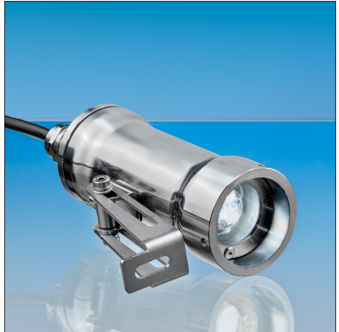
Lumistar luminaire ESL 53-LED-KS with hinged bracket