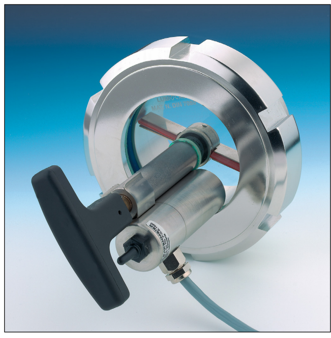
Mini Lumistar luminaire USL 01, mounted on a screw-type sight glass fitting with Lumiglas sight glass wiper SW l