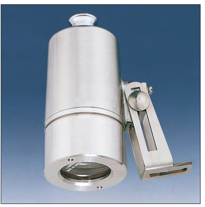
Lumistar luminaire ESL 25, stainless steel