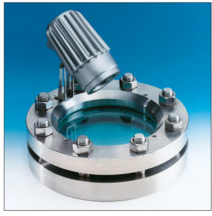
Application as combined sight and light glass on a sight glass fitting acc. to DIN 28120, mounted using a hinged bracket