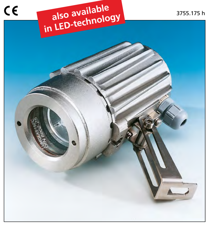
Lumistar luminaire USL 05

120 V Halogen lamp 12 V/5 W 230 V Halogen lamp 12 V/5 W