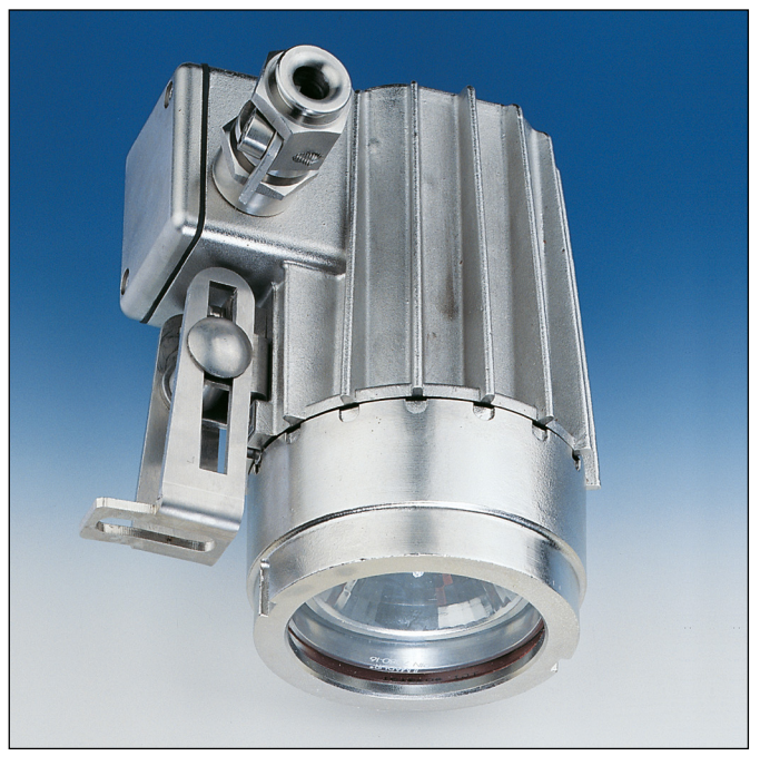
Lumistar luminaire ESL 26, stainless steel with integrated terminal box and hinged bracket fastening