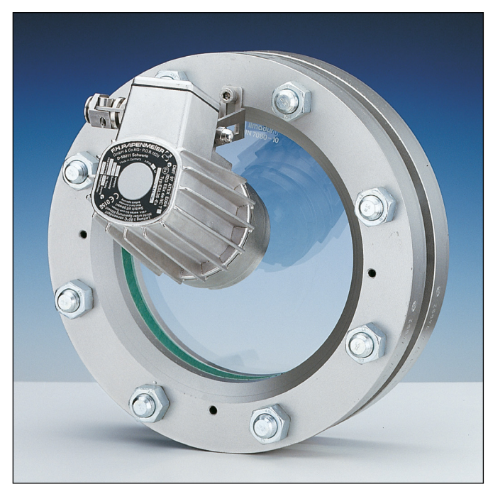
Application as a combined sight and light glass mounted on a sight glass fitting acc. to DIN 28120 using a hinged bracket