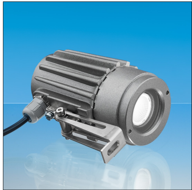
Lumistar Leuchte USL 05-LED