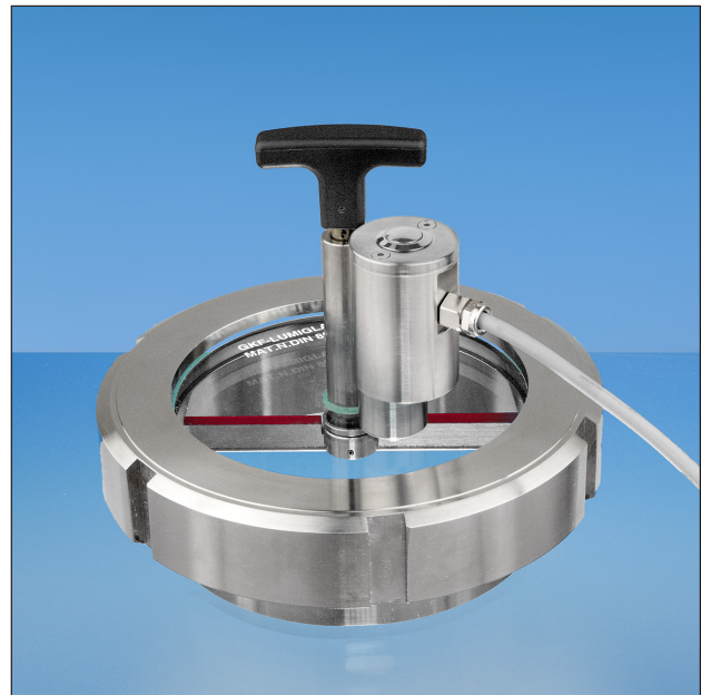
Lumistar luminaire ESL 51-LED-HK used on a screw-type sight glass fitting with Lumiglas screen wiper unit SW I