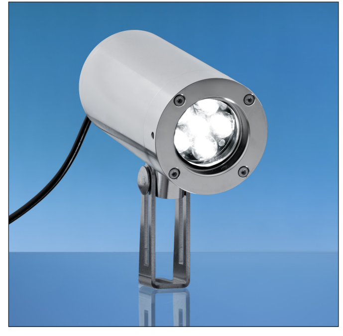
Lumiglas luminaire ESL 55-LED-Ex