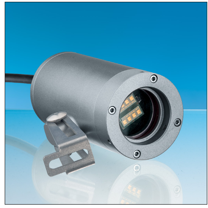
Lumiglas signalling device M55-BD-Ex