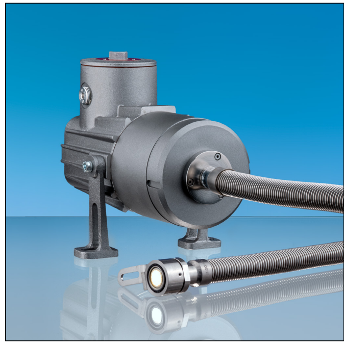
Lumistar Luminaire Lumiflex USL 08 LF-Ex