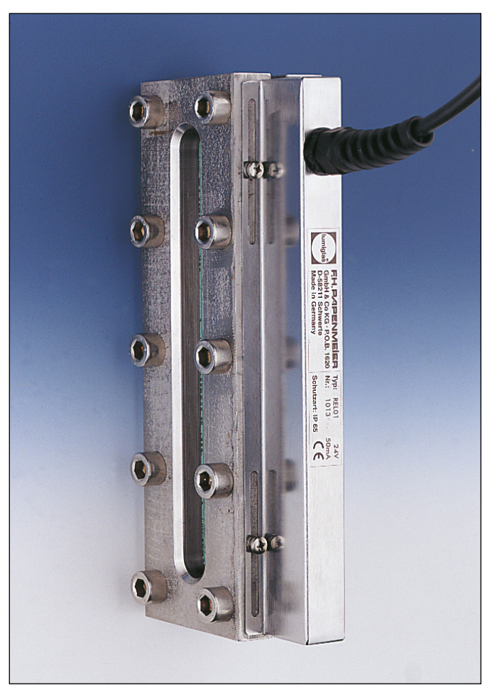
Lumistar luminaire REL 01, attached to the cover flange of a rectangular sight glass unit, side view