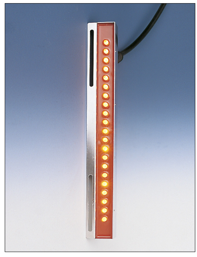
Lumistar luminaire REL 01, luminary side

Additional Lumistar luminaires REL 01 can be installed if the fittings are longer.