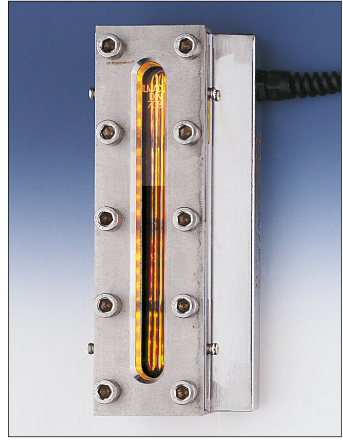
Front view of rectangular sight glass unit, length 250 mm, with side-mounted Lumistar luminaire REL 01 in stainless steel