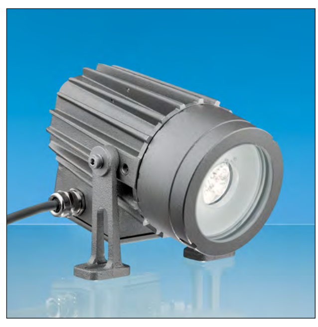
Lumistar luminaire USL 07 LED-Ex with terminal box