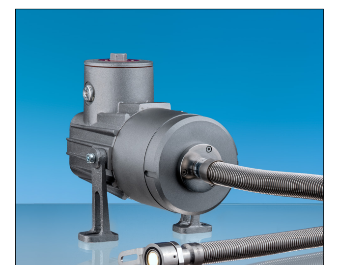
Lumistar luminaire 'Lumiflex' USL 08 LF-Ex