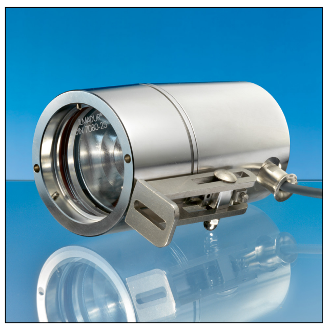
Lumistar luminaire ESL 27-Ex with hinged bracket